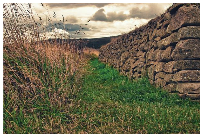
battlefield and visit to the whisky distillery